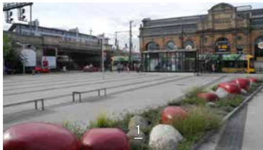
1. Mitte railway station's forecourt

Dresden has launched a major urban renewal programme. Historische Friedrichstadt and Wilsdruffer Vorstadt districts are part of it. Several public spaces from these two districts have been targeted as specific pilot sites for the USER project.