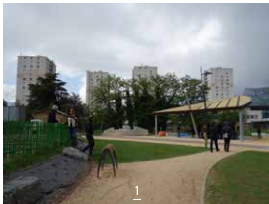
2. Renaudie neighbourhood