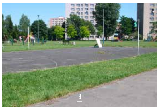
3. Wide greenery in Azory

for this purpose. A lot of social problems arise from public spaces and the lack of infrastructure: spatial barriers (exclusion of elderly and disabled people), no place for young people, poor location of benches and lighting, dark corners, desolated places giving a feeling of insecurity. The fragmentation of various public spaces' ownership forms is also an issue.