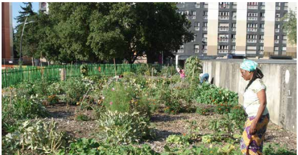
1. Workshop in the vegetable garden

space, identifying and discussing growing problems and adjusting the management forms according to uses, developing co-construction with inhabitants, observing and monitoring through the working group Iles de Mars/Olympiades.