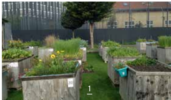
1. Shared urban garden in Sundholm

Copenhagen is working on Sundholm, which is a neighbourhood historically marginalised. It housed prisons, psychiatric hospitals, drug addicts, etc. Today, the municipality would like to give it a more welcoming image to attract new people, while strengthening a vocation of welcoming homeless people.