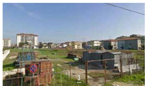
3. Fontanelle-Sambuceto district

to consider is that ownership of these spaces is mostly private so each regeneration project of these spaces for public use must necessarily be conducted through a public-private partnership. The situation is further aggravated by some frequent problems such as: lack of a feeling of belonging for inhabitants, lack of feeling safe, especially at night, insufficient pedestrian access, lack of urban quality both in public and private parts, such as public streets and sidewalks, poor maintenance of green areas, etc.