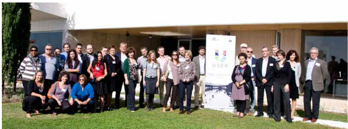
1. USER's partners gathered in the kick-off meeting in Malaga

It entails going beyond the quality of the physical form of public space and focusing on the intensity and quality of the social relations it facilitates, in its potential to make groups and individuals interact, and in its capacity to encourage symbolic identification.