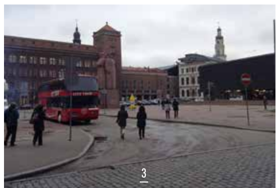
3. Latvian Riflemen Square

attributes of an inclusive place, not enough garbage bins, etc. In Spikeru Street, a very well situated place, the main problems are the lack of security, maintenance, urban quality and functional uniformity. A lack of separation between the different functions of the street and lack of communication among different types of traffic is one of the main challenges.